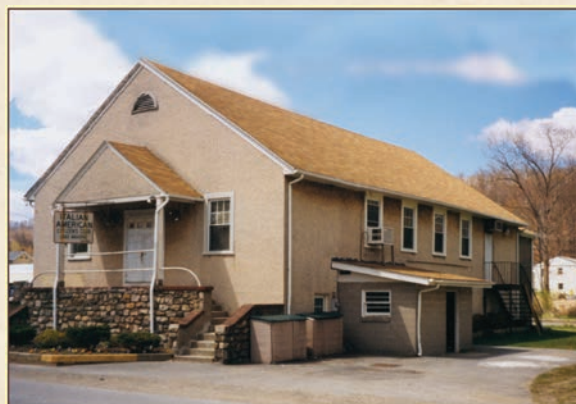
THE ITALIAN AMERICAN CITIZENS CLUB OF LAKE MAHOPAC - 1999

Almost all the Italian families were living in the Buckshollow Road area, which was at that time a dirt road and also the